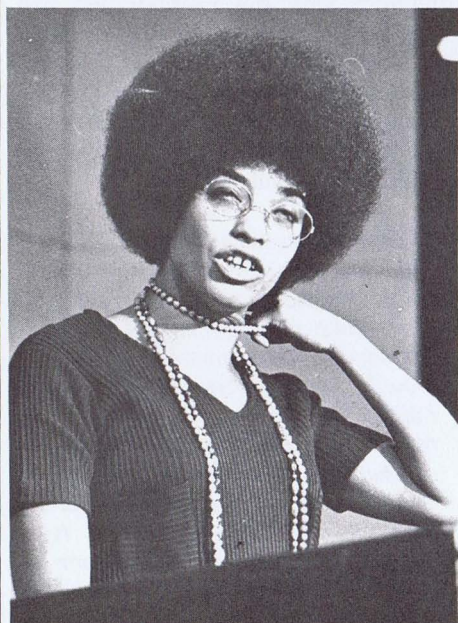
Communist Angela Davis teaches at U.C.L.A.

did a very peculiar thing. As a member of the Black Panther Party she joined the Communist Party — rather like a chicken becoming an egg. During recent years most young Communists who are black have become members of Maoist groups like the Panthers, S.N.C.C., the Progressive Labor Party, R.A.M., or the Republic of New Africa, where they can personally lead and manipulate greater numbers. The New Leftists, black and white, have considered the old-line Communist Party to be “square” and “conservative,” composed of ancient grey-beards from the Pleistocene